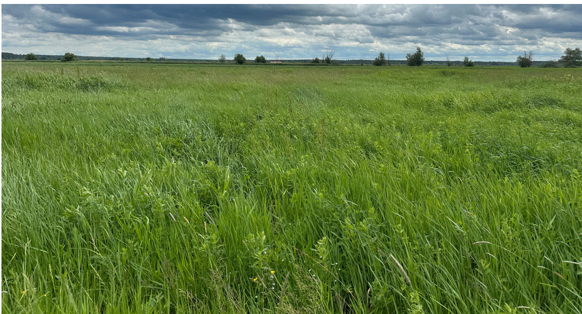
Figure 2: Plot 1 (Schleuse Schwedt) – Habitat Type 6440.